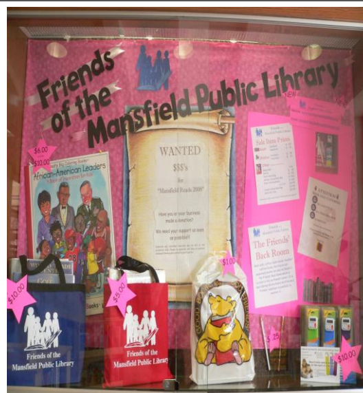
Our current display case!

We want people to know that our library has Friends!